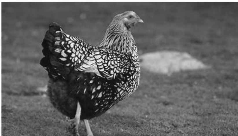
Wyandotte Silver Lace