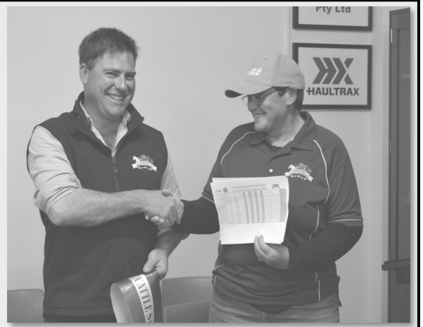
Lightweight Carcass 1 st Blythewood Pastoral

THE WAROONA AGRICULTURAL SOCIETY IS GRATEFUL FOR THE SUPPORT OF SPONSORS FOR THE TRADE CATTLE SECTION - BELOW AND ON PAGE 20