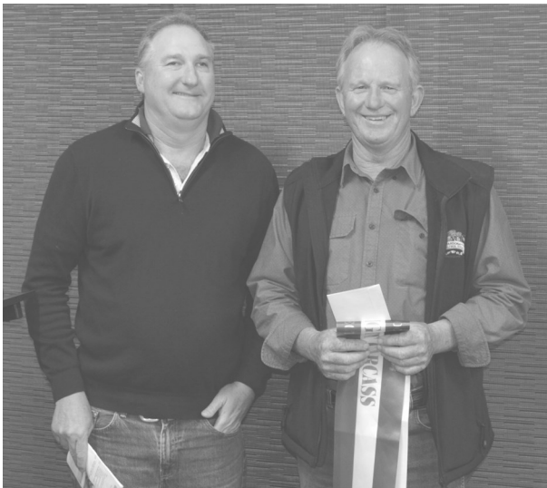
Heavyweight Carcass 1 st Bancell Falls

THE WAROONA AGRICULTURAL SOCIETY IS GRATEFUL FOR THE SUPPORT OF SPONSORS FOR THE TRADE CATTLE SECTION - BELOW AND ON PAGE 20